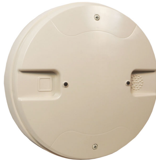
W-GATE Wireless System Gateway